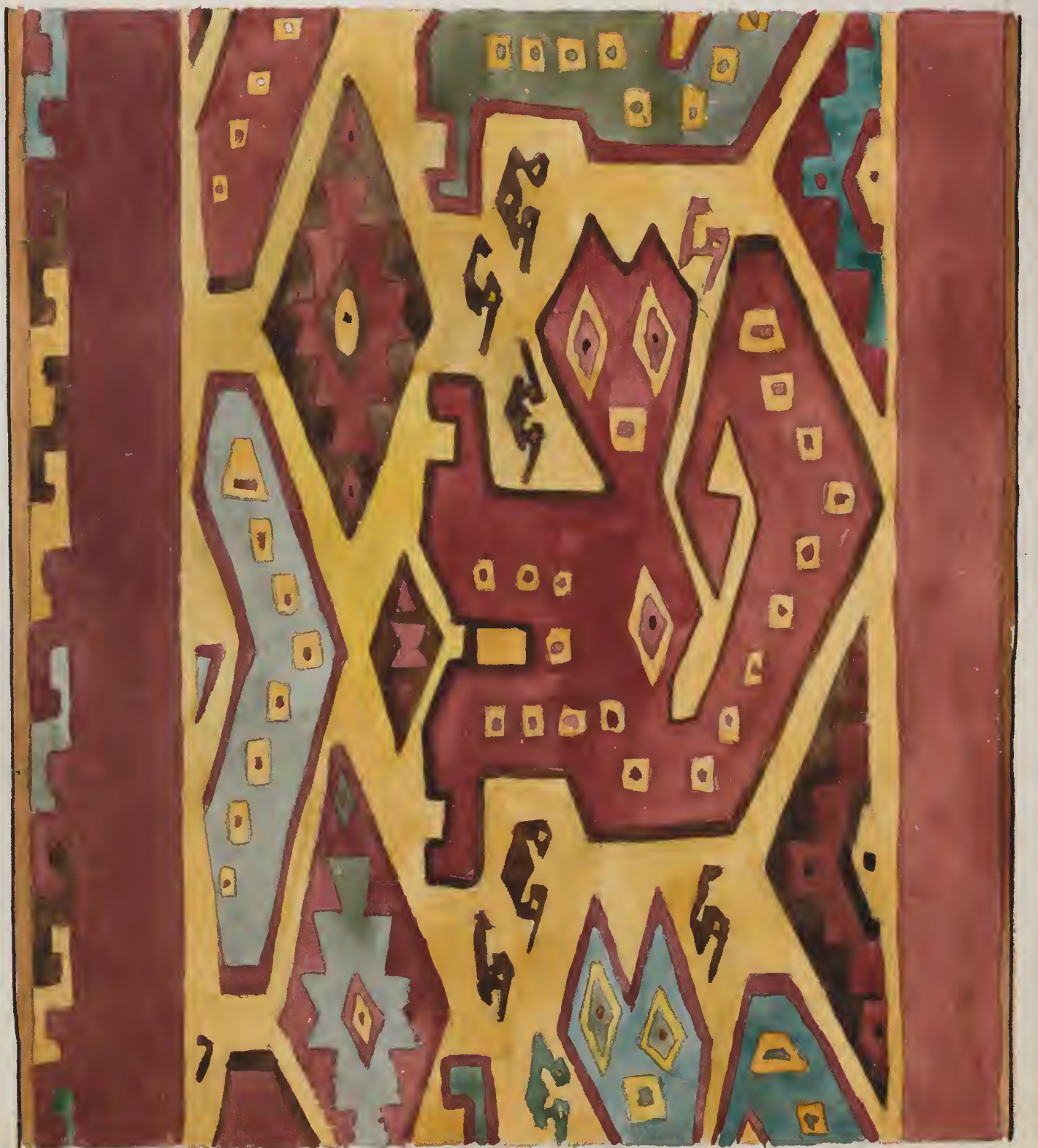
Border - fragment